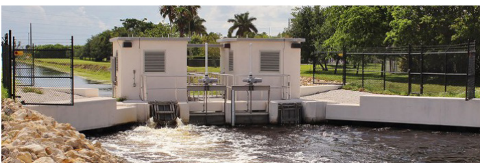
Florida Lake Worth Drainage District

SmartCover's industry leading analytics include a comprehensive dashboard with alarms and notifications that monitor systems continuously 24 hours per day, 7 days per week. It is also the only North American sewer monitoring company utilizing the Iridium satellite network. SmartCover has cumulatively acquired more than 15,000 years of data to provide robust and reliable data acquisition and alarming functions. The built-in event management platform integrates localized weather and tidal data from the National Oceanic and Atmospheric Administration (NOAA) as well as USGS stream data to help respond to issues before they become environmental, financial and public health emergencies.