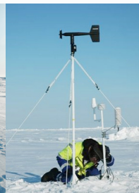
System Controller Display